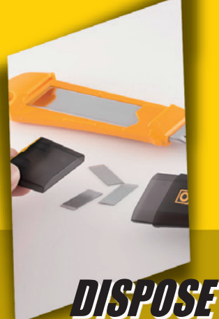
Dispose the segments in bulk when case becomes full.