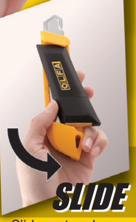
Slide up to release.